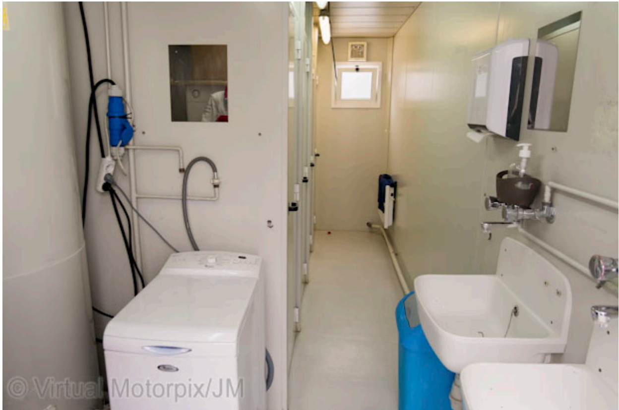
Private bathroom with their own washing machine

The Toyota team are very approachable and this presents problems when a driver just wants to pop to the bathroom, which otherwise could be over the other side of the paddock, it can be 20 or 30 autographs later before the mission is accomplished. To overcome this problem there is a functional array of toilets, showers and even a trusty washing machine within the accommodation block to keep up to date with the laundry!