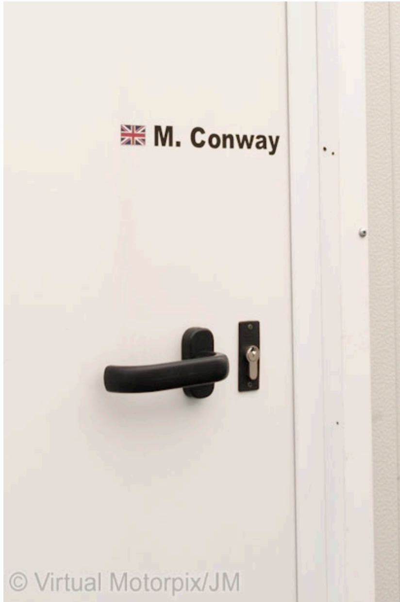
A simple white door with the name of the driver hides their private sanctuary

Once inside the hospitality building you enter a haven of peace with the trappings of corporate hospitality. Toyota may not be the most extravagant hosts but they are by far the friendliest and everyone you meet has a happy smile and welcome for you. Alastair was very relaxed and allowed me to snap away as we moved from the Hospitality area to outside and