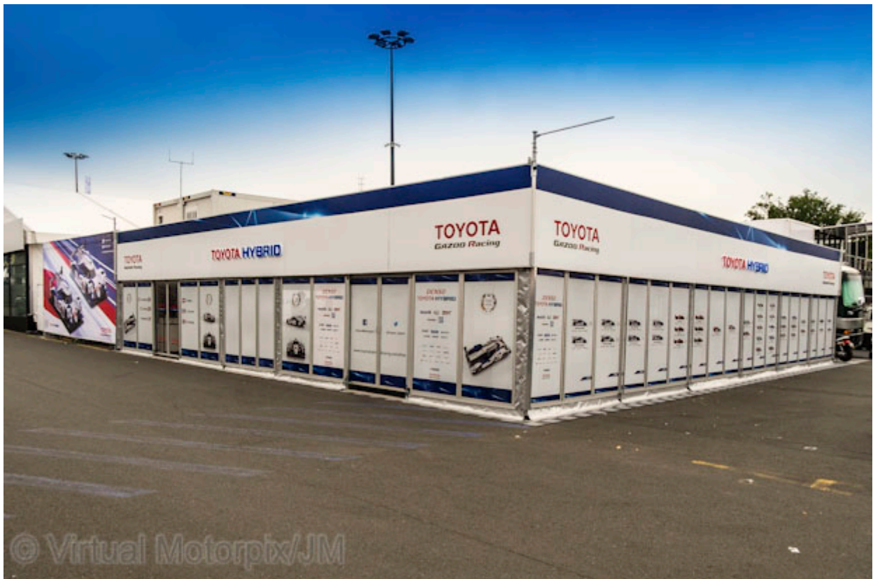
Toyota hospitality, Le Mans 24H 2015

Online version: https://www.virtualmotorpixblog.com/where-do-the-drivers-sleep-at-le-mans/