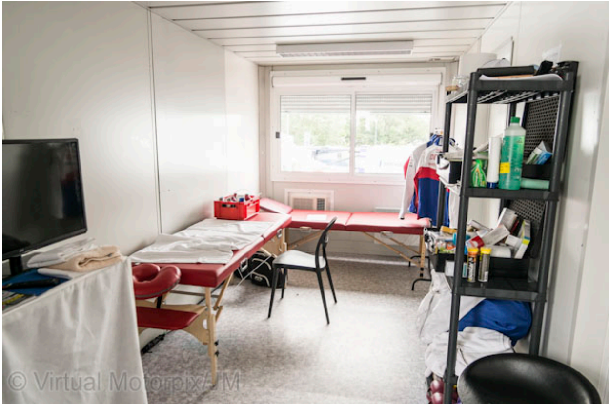
Toyota's physiotherapy room is a necessity

The final but probably most important part of the driver accommodation is the physio and medical provision. The team has two physiotherapists and a doctor to attend to the needs of the whole team and they are based just outside Anthony and Kazuki's rooms. This is a serious rock and roll life style when you have your own en-suite medical practitioner!