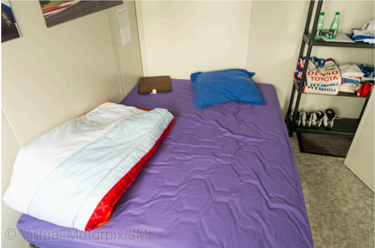
Plain but functional

The drivers' bedrooms are spartan and functional with a good sized bed with a proper mattress, duvet and pillows, a far cry from the camping chairs and quiet corner reserved for the mechanics in the garage. Each room has heating, air-con, wi-fi access and facilities to store clothing, even a poster of their company car hangs on the wall.