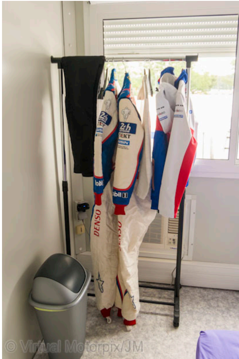
Two sets of clothing ready for each driver

Drawing on the teenage child analogy, when the drivers are in their bedroom they are expected to sleep or at least rest. The team ethos supports the view that, win or lose, they do it together and after a period of reflection when things have gone badly, drivers aren't allowed to sulk in their room watching TV or playing video games. They are supported by the team in the rest of the hospitality facility.