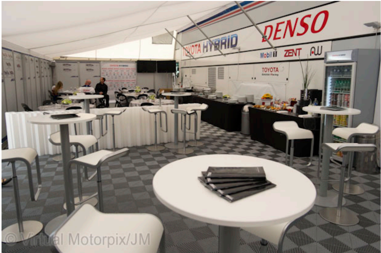
The meet and greet area of Toyota at Le Mans

round the drivers' accommodation facility in the paddock.