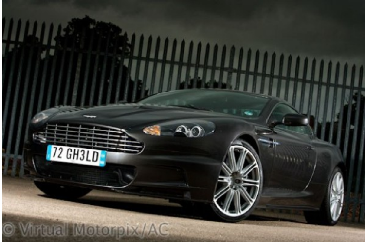
Aston Martin DBS Quantum of Solace film car, 2007