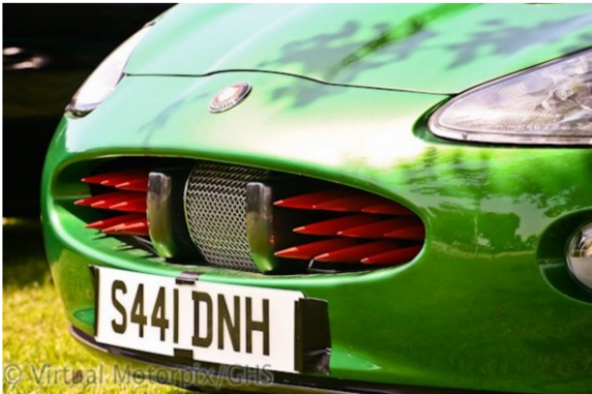
Zao's Jaguar XKR from Die Another Day (2002). Close up of front grille missiles.

Online version: https://www.virtualmotorpixblog.com/the-bond-cars/