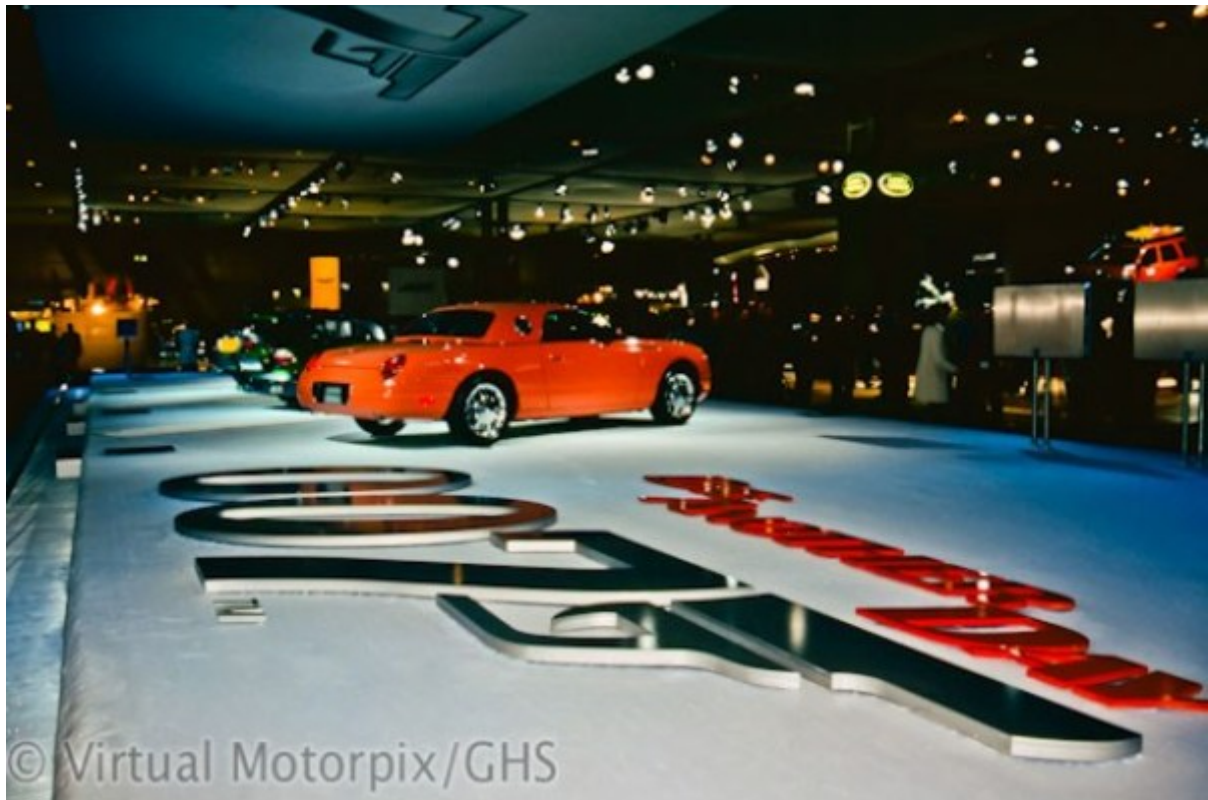
Ford Thunderbird MY2002 owned by Giacinta "Jinx" Johnson in Die Another Day

In the latest Bond movie, Skyfall , Honda contributed twenty five CRF250R motorcycles for various stunts, twenty of the bikes being modified for the filming of various special scenes which took place in Istanbul and Adana, Turkey, earlier this year. Two motorcycles in particular were modified to look quite different from the others, these being the 'Police' and 'Street Merchant' bikes, but they were in fact all the same machines.