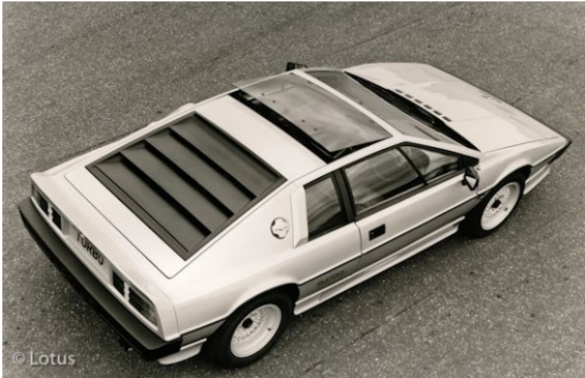
1984 Lotus Espirit Turbo. This model doesn't appear in the film itself but instead two Essex Turbo Esprits appear in For Your Eyes Only (1981)

The luckiest spy on the planet always seems to get the keys to Q's latest set of wheels, which over the years has included a vast array of cars, but the best known of them all is undoubtedly the Aston Martin , and most notably the DB5, which appeared for the first time in the third Bond movie, Goldfinger . What the Bond name hasn't done for the Aston Martin brand isn't worth knowing, but then the famous British car has got Bond out of numerous scrapes with villains of all manner and description.