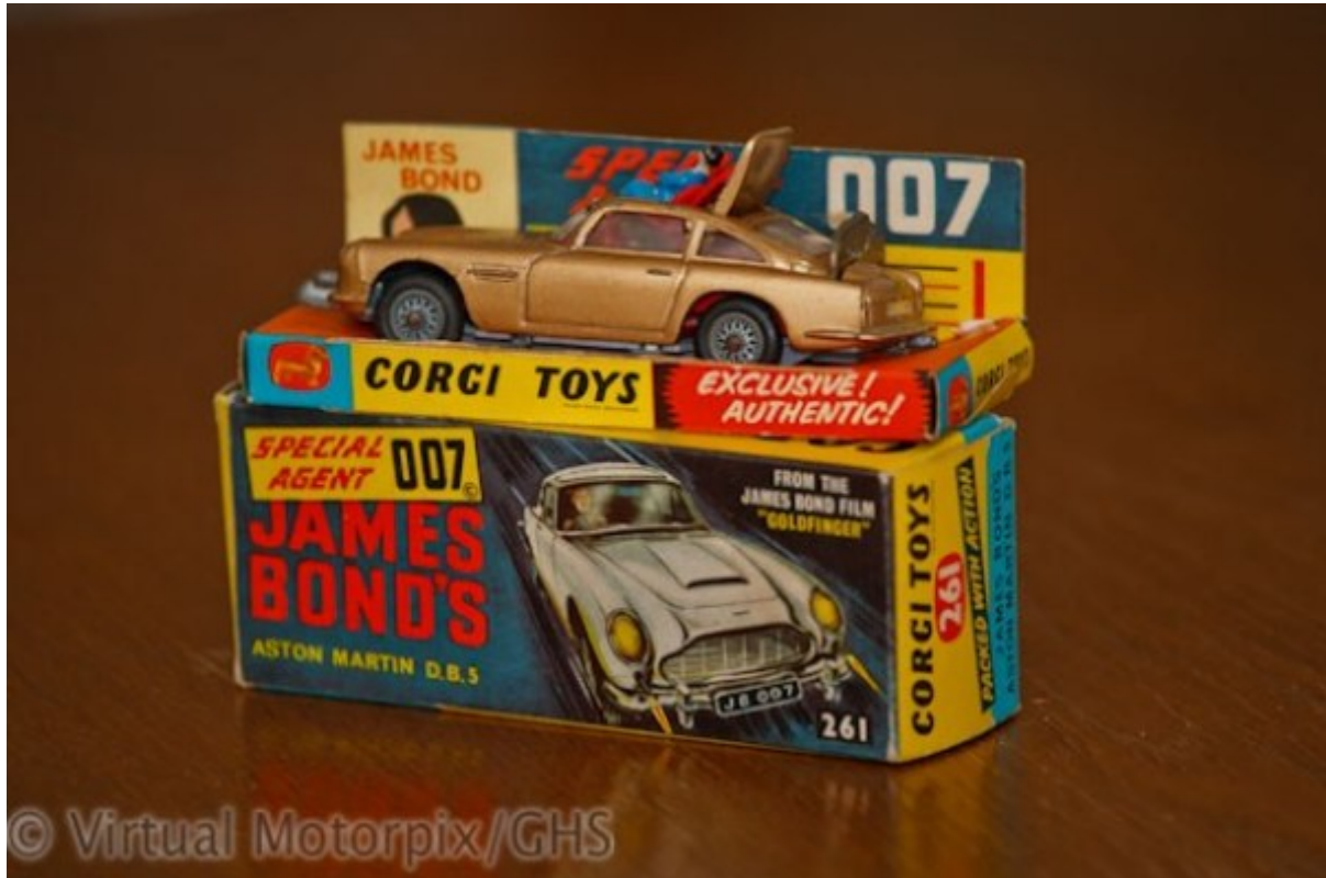
James Bond's Aston Martin DB5 from Goldfinger. Model car by Corgi Toys

It's amazing that spies and villains in the Bond movies, of the female variety, always seem to be the most gorgeous, leggy numbers around, it almost makes you want to join MI6 so that you too can bump into a few of them. And of course, Moneypenny is a bit dishy too, so it can't be a bad life being a spy. Then of course you also have access to all the latest gadgetry, courtesy of Q, who also happens to be in charge of the MI6 fleet of cars which naturally include the latest, fastest supercars on the planet and are usually packed with all manner of extra goodies like mortar launch tubes, rockets, skis, parachutes, containers that deposit oil on the road, bullet-proof shields, machine guns...Bond is truly one dangerous dude.